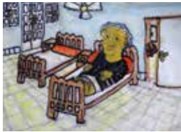
Egypt, L'Arche al Fulk Hani Zaki Habeeb