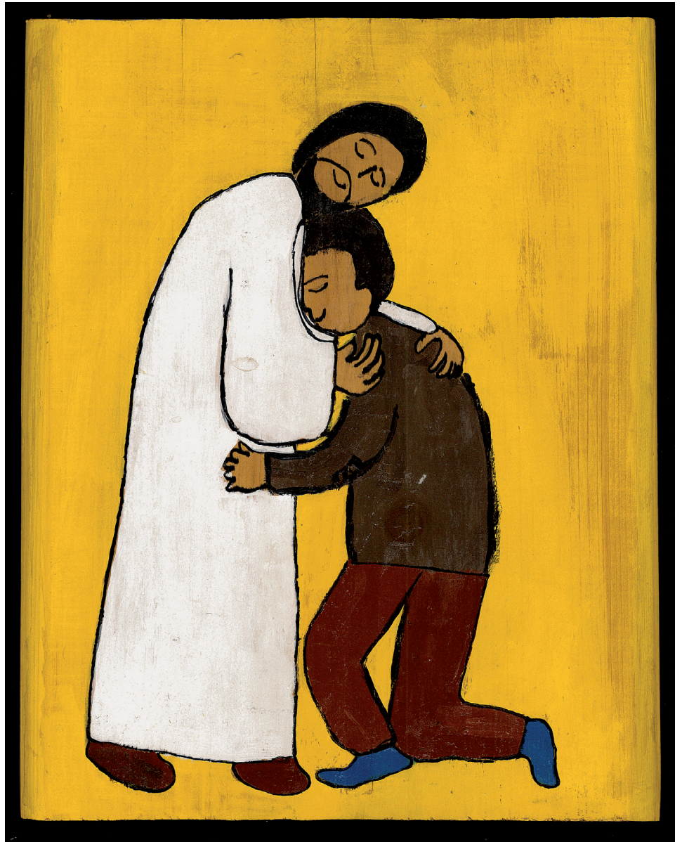
Masaichi Wakamoto "A prodigal son", Acrylic on wood, 26cm x 22cm, 2007