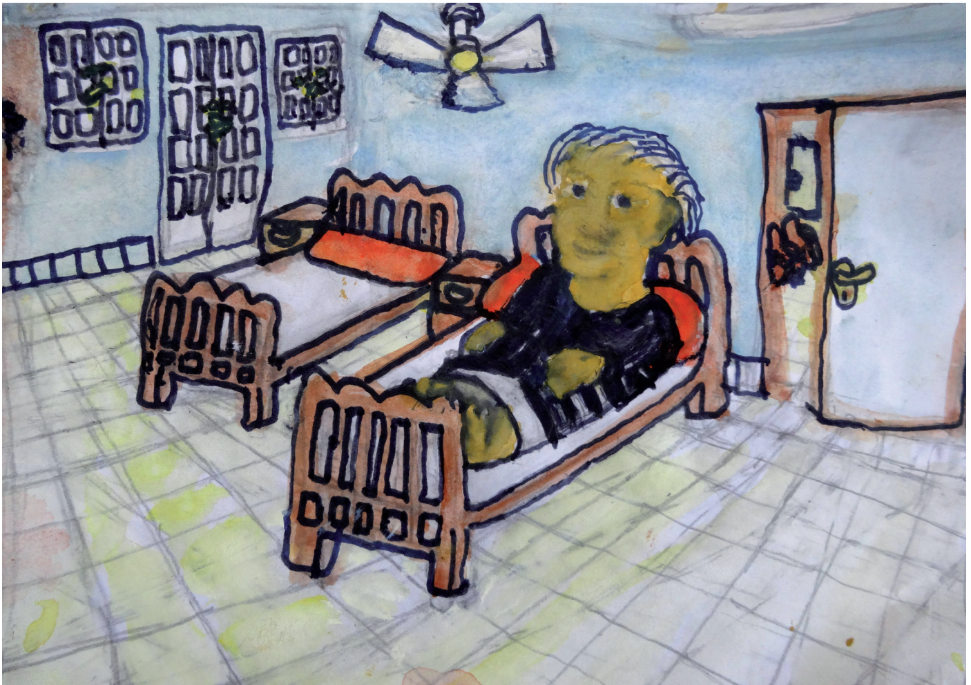
Hani Zaki Habeeb 'Untitled'